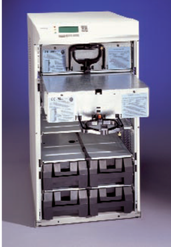
Powerware 9170+ 6-slot configuration