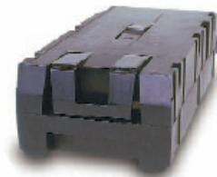
Battery Module (2 per slot)